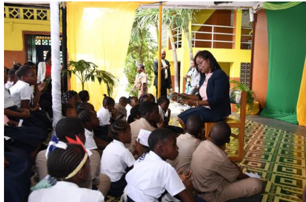
Lady Allen addresses students at Read Across Jamaica Day - at the Holy Family Primary and Infant School in Kingston, with support of the IBI.