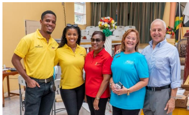
Her Excellency the Most Honourable Lady Allen (c) at the annual Vision Mission Health Project with the Issa Trust Foundation, alongside IBI Ambassadors.