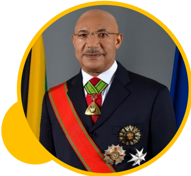
His Excellency Sir Patrick Allen, ON, GCMG, CD, KSt.J Chairman