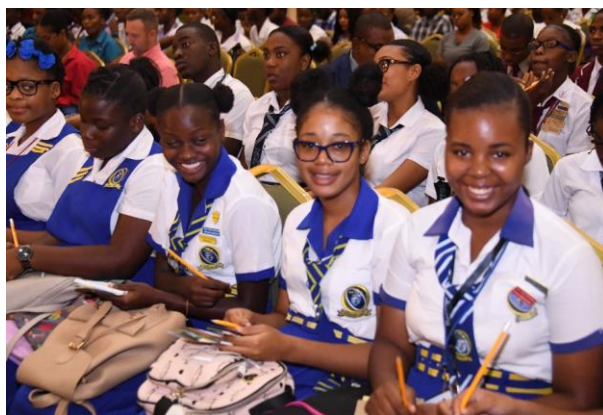
Student delegates at the 2019 Youth Consultative Conference.