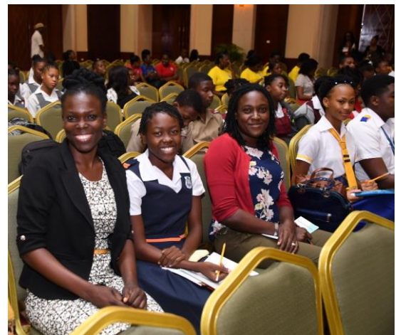
Attendees at the 2019 Youth Consultative Conference (YCC)