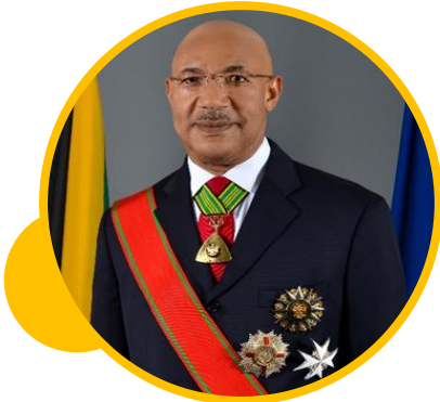
His Excellency The Most Honourable Sir Patrick Allen, ON, GCMG, CD, KStJ Governor-General