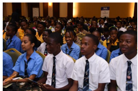
Student attendees at the Youth Consultative Conference (YCC)