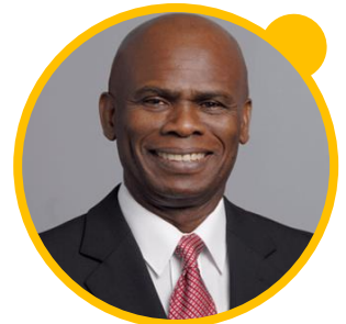
The Hon. Steadman Fuller, CD, JP Custos Rotulorum – Parish of Kingston